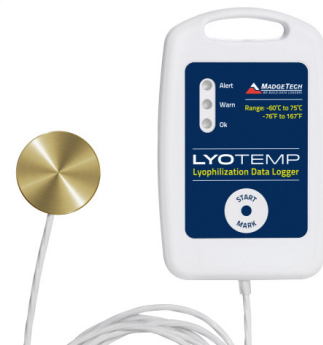
Compatible with the HiTemp140X2-FP data logger series, HiTemp140-FP data logger and the LyoTemp Data Logger.