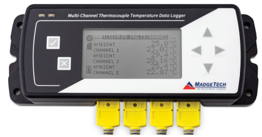
*Thermocouple Probes Sold Separately

4 and 8-Channel Thermocouple Data Loggers with LCD Screen